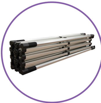
QTY 1: Frame w/ Pre-Installed Graphic