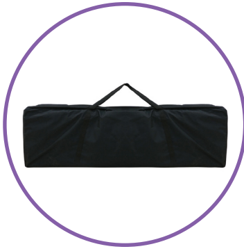
QTY 1: Black Nylon Carry Bag